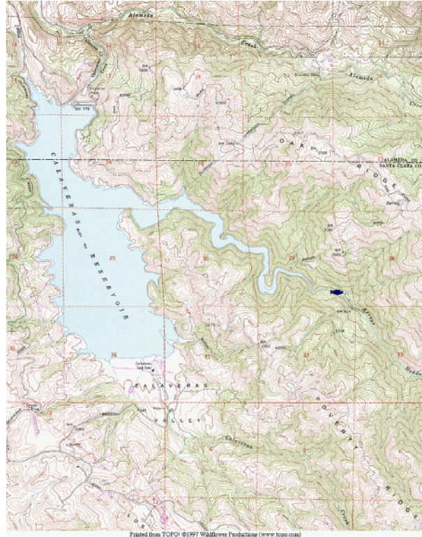
Figure 2. Calaveras Reservoir and fish trapping station on Arroyo Hondo.

Fundamental to understanding rainbow trout in the San Antonio and Calaveras reservoir systems is determining species abundance. The goal of this long-term project is to establish a series of estimates of the number of adult rainbow trout supported by each body of water, quantifying population sizes about once every five years. This Technical Memorandum (No. 2-04-006) represents the SFPUC’s initial adult rainbow trout population size estimates.