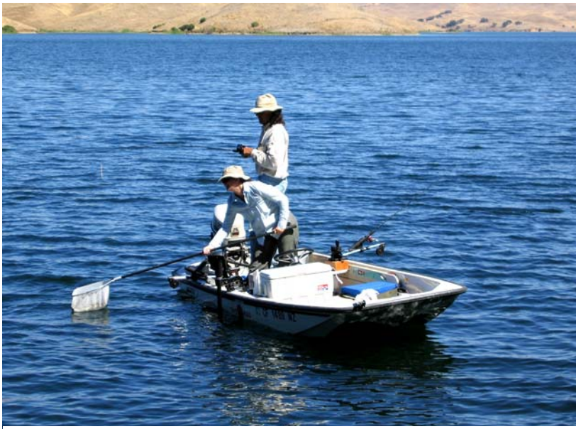
Figure 3. Rainbow trout were recaptured at San Antonio and Calaveras reservoirs by trolling.

To estimate the population sizes of adult rainbow trout in San Antonio and Calaveras reservoirs, Schnabel's multiple census mark-and-recapture method, as modified by Chapman, was used (Ricker 1975). The formula, N = \sum(C_i M_i) / (R + 1) , where N is the estimated population size, C_i is the total number of fish caught during the i^{\text{th}} recapture trip, M_i is the size of the marked fish sub-population (number of initially marked fish, plus new fish marked during previous recapture trips, minus mortalities from previous recapture trips) at the time of the i^{\text{th}} recapture trip, and R is the total number of recaptures, is best suited to situations in which too few fish are collected during a single recapture outing to make a reliable population size estimate. It relies on a series of recapture trips in which all fish collected are returned to the population after the non-marked fish are marked. All observed mortalities were recorded and subtracted from the known number of tagged fish prior to population size calculations.